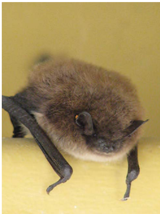
Figure 3.11 Little Brown Bat