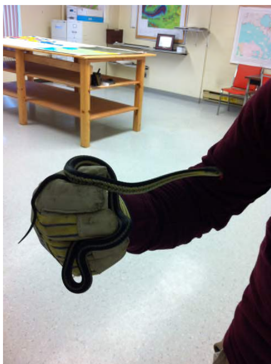
Figure 3.12 Garter Snake