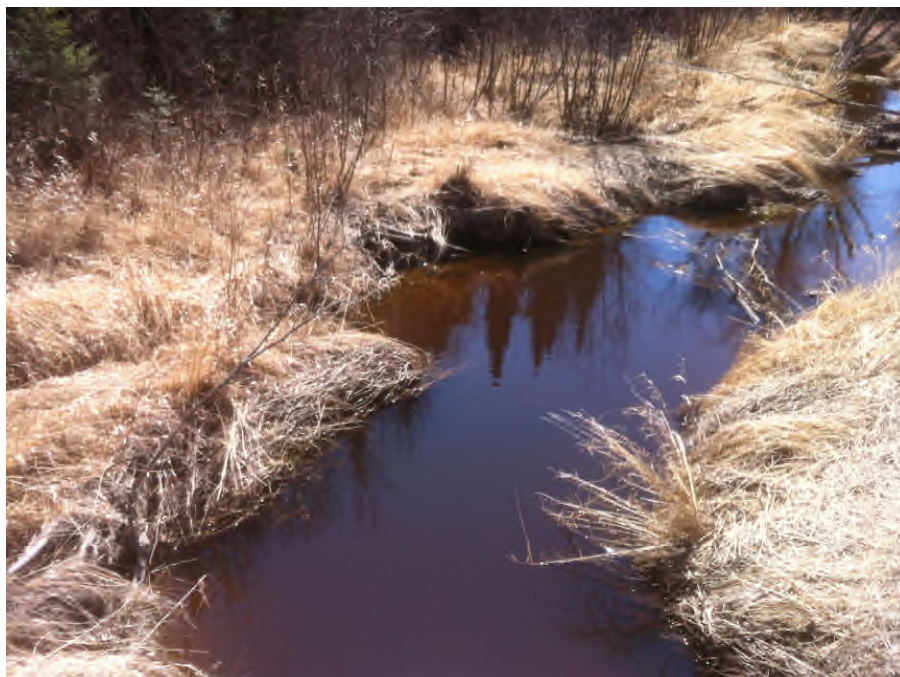
Figure 3.5 Surface Water Site (TL3)