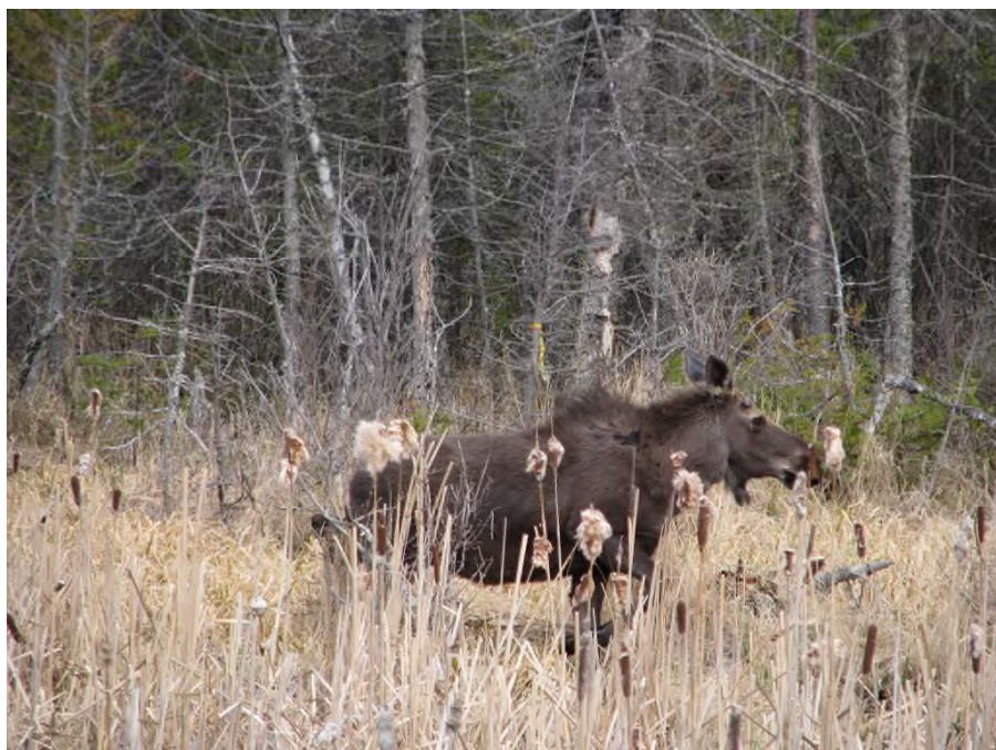
Figure 3.16 Moose