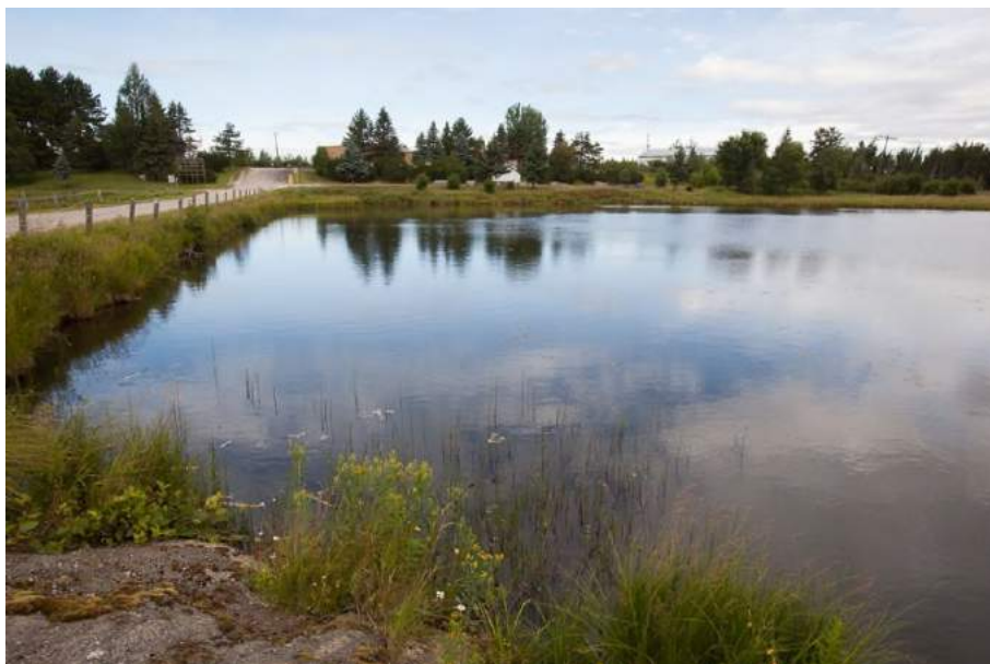
Figure 2.1 Tree Nursery Irrigation Ponds (Water Intake)