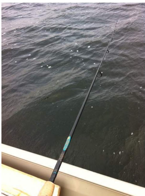
Figure 3.8 Fish Tissue Program 2012