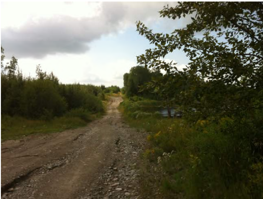
Figure 2.10 Normans Road, East of Equipment Storage Area