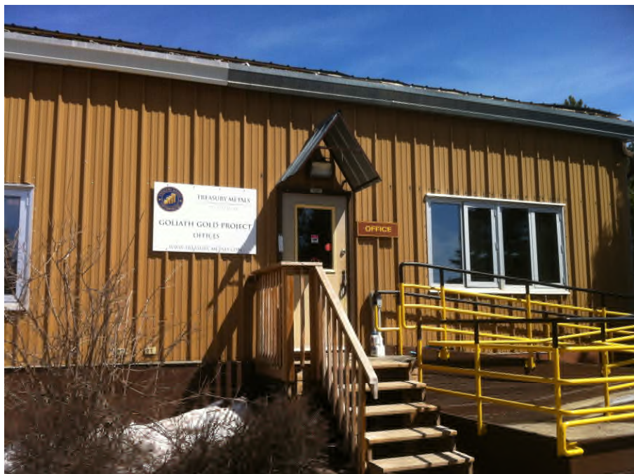
Figure 1.1 Goliath Gold Project Office