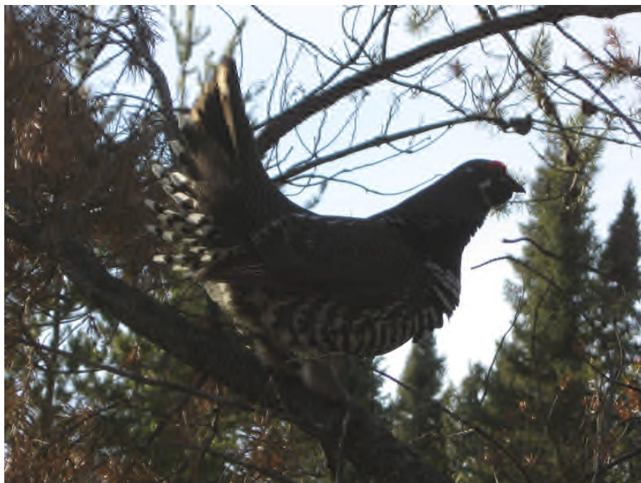
Figure 3.15 Ruffed Grouse