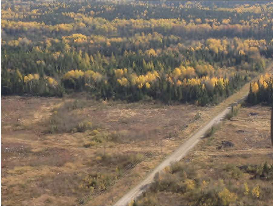
Figure 2.5 Tree Nursery Road and Power Line Infrastructure