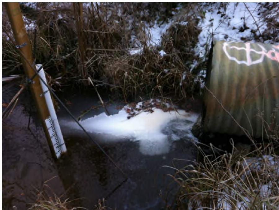
Figure 3.1 Surface Water Site (SW2)