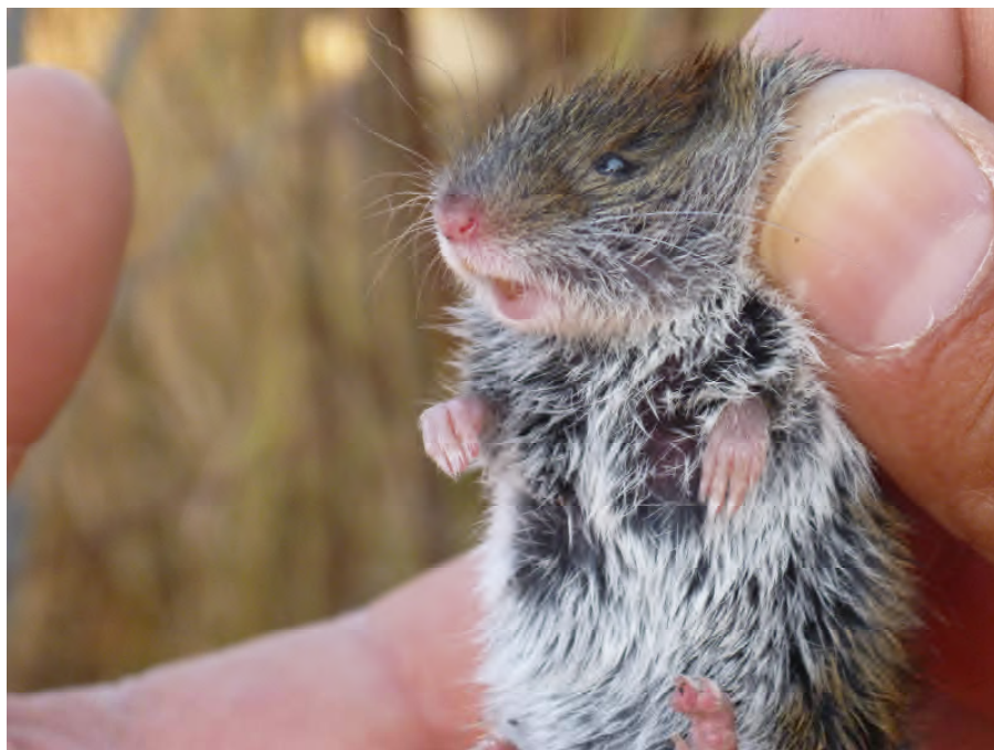
Figure 3.17 Deer Mouse