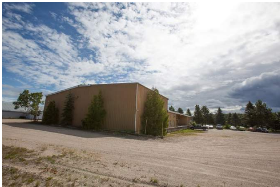
Figure 1.5 Goliath Gold Project Office (Main Warehouse)