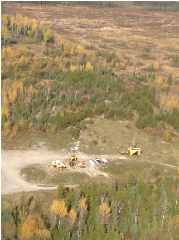
Figure 2.7 Figure 2.6 Current Equipment Storage Area (Middle of Proposed Open Pit)