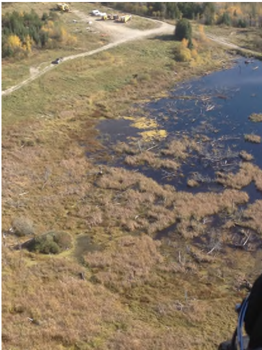
Figure 2.6 Current Equipment Storage Area and Beaver Pond Pond (Middle of Proposed Open Pit, and location of Crown Land central to development)