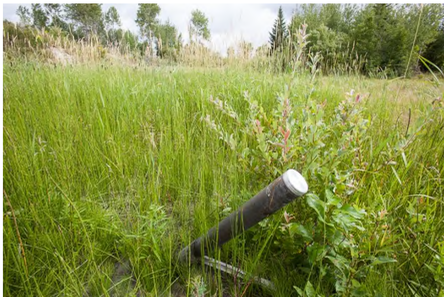
Figure 2.3 Diamond Drill Hole, East Section of the Proposed Open Pit