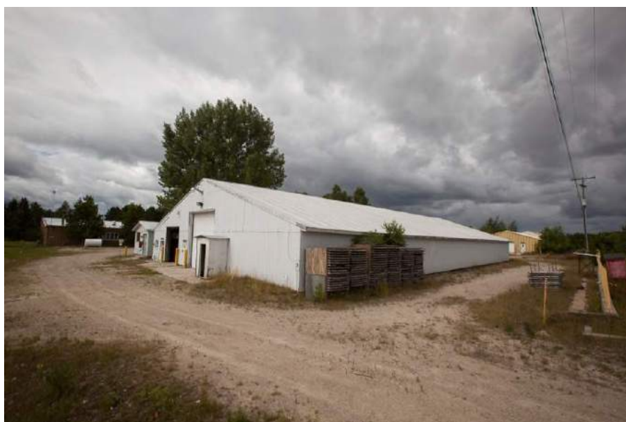
Figure 1.6 Goliath Gold Project Warehousing Infrastructure