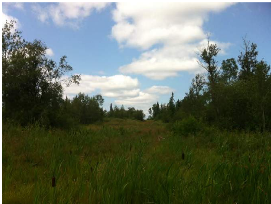
Figure 2.12 Topography and Vegetation (Eastern Section of Proposed Open Pit)