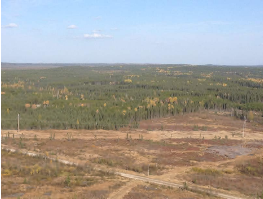
Figure 2.13 Tailings Storage Facility Location (North of Power Lines)