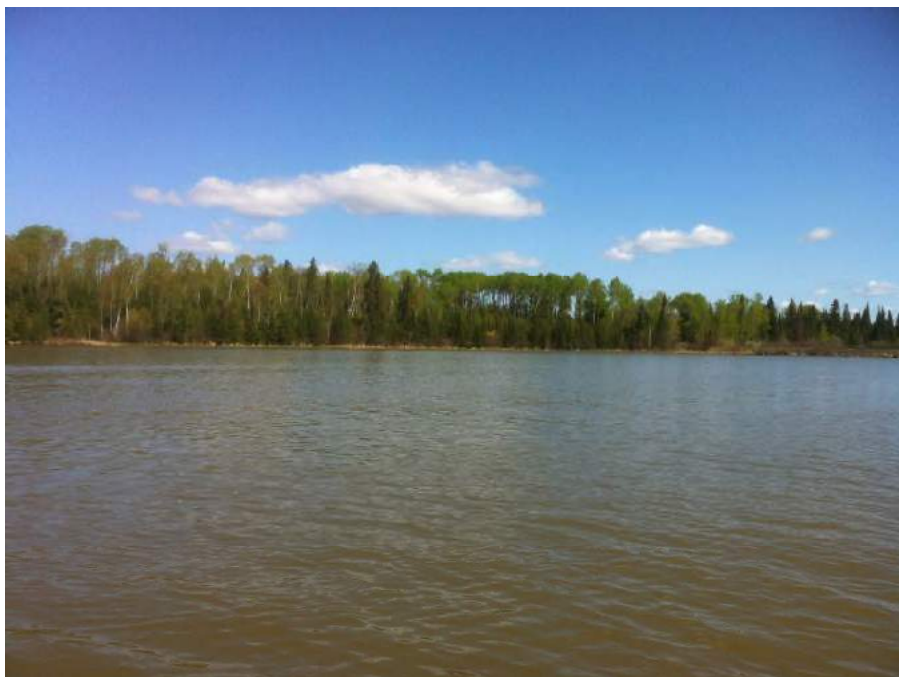
Figure 3.4 Keptyn's Bay on Wabigoon Lake