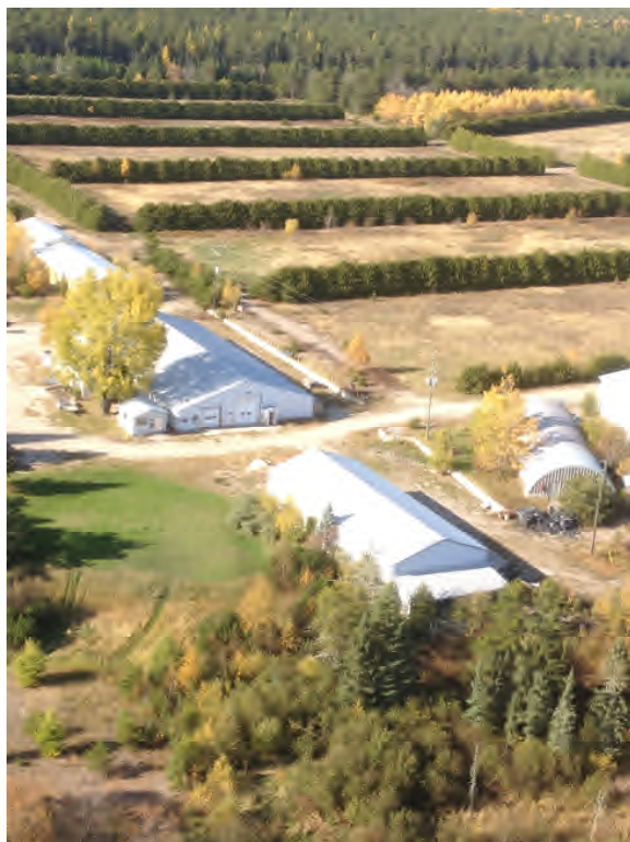
Figure 1.4 Goliath Gold Project Warehousing Infrastructure