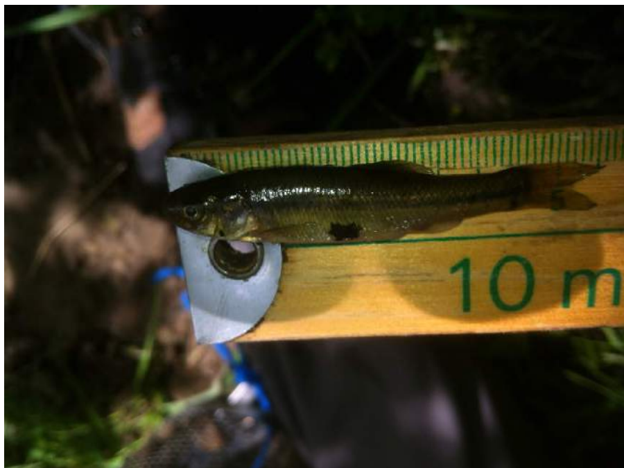
Figure 3.9 Pearl Dace