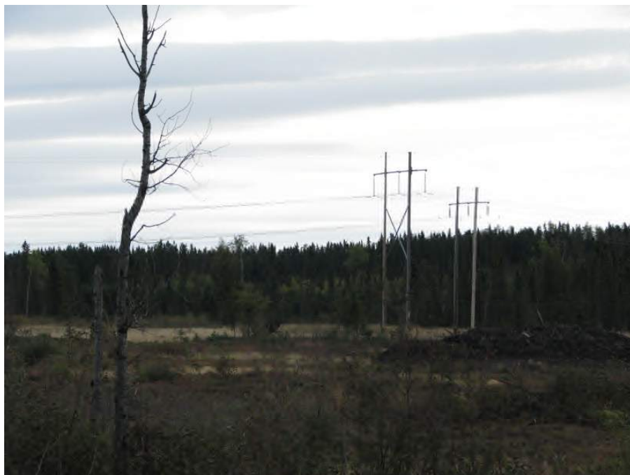
Figure 2.11 Power Line Infrastructure