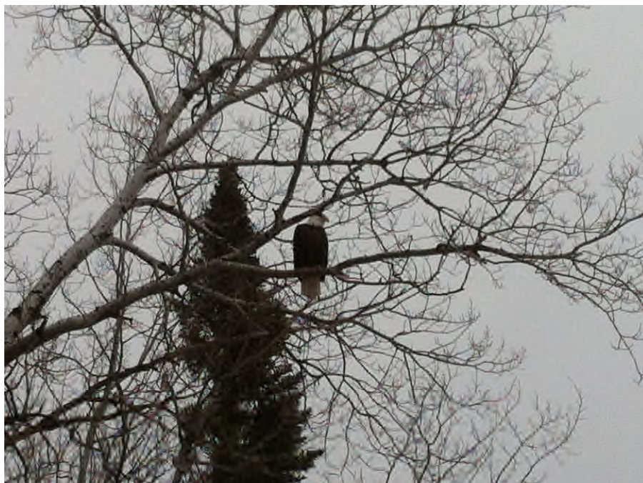
Figure 3.14 Bald Eagle