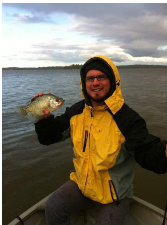
Figure 3.10 Black Crappie