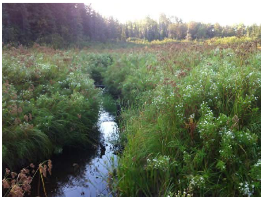
Figure 3.2 Surface Water Site (JCTa)