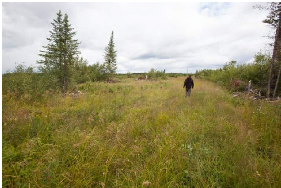
Figure 2.4 Topography of the Proposed Open Pit