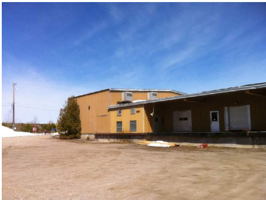
Figure 1.3 Goliath Gold Project Office (Main Warehouse)