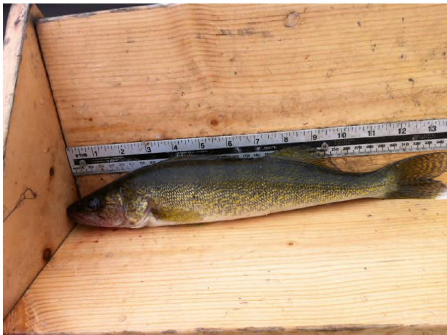
Figure 3.7 Walleye