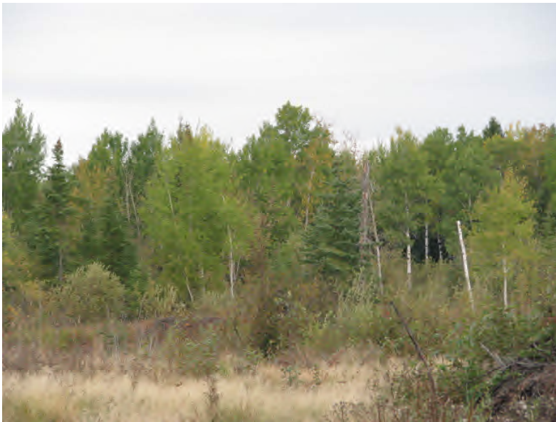
Figure 2.8 Topography and Vegetation (Eastern Section of Proposed Open Pit)