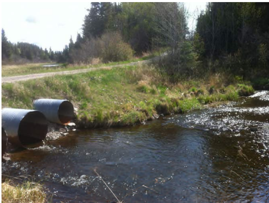
Figure 3.3 Surface Water Site (SW1)