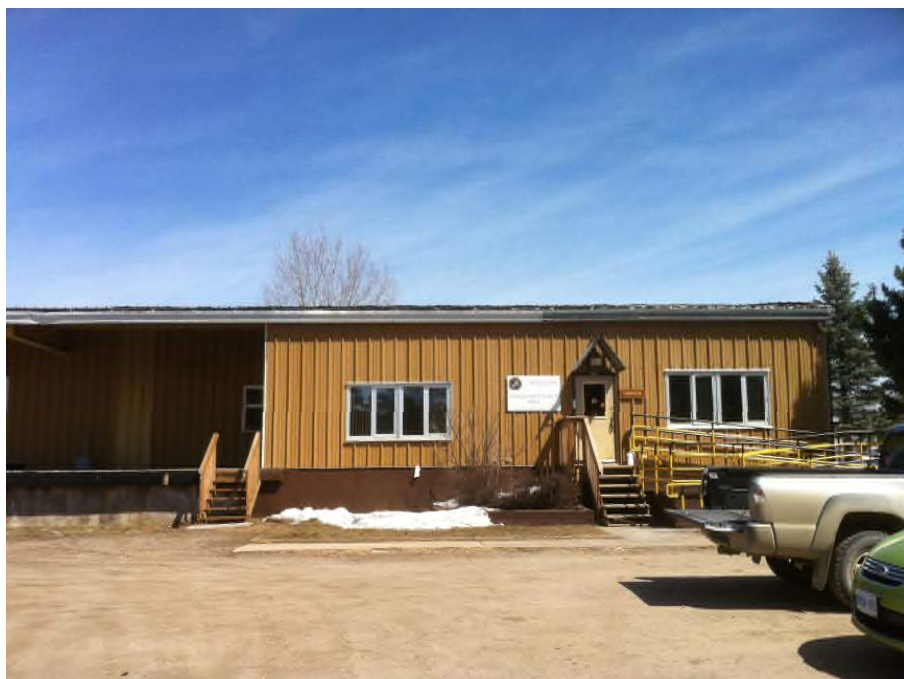
Figure 1.2 Goliath Gold Project Office