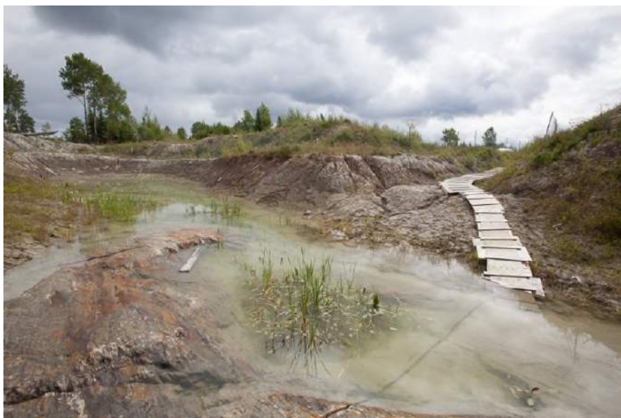
Figure 2.2 Deposit at Surface, Middle of the Proposed Open Pit