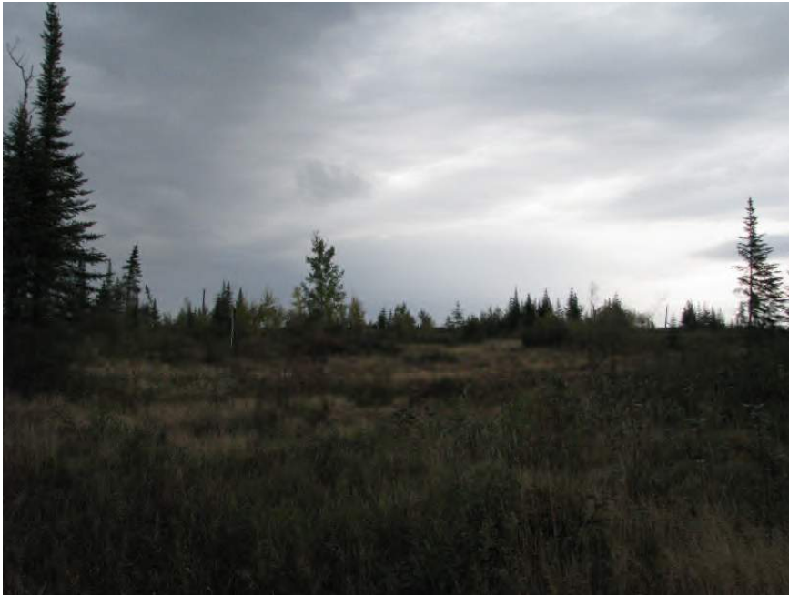
Figure 2.9 Topography and Vegetation (Center Section of Proposed Open Pit)