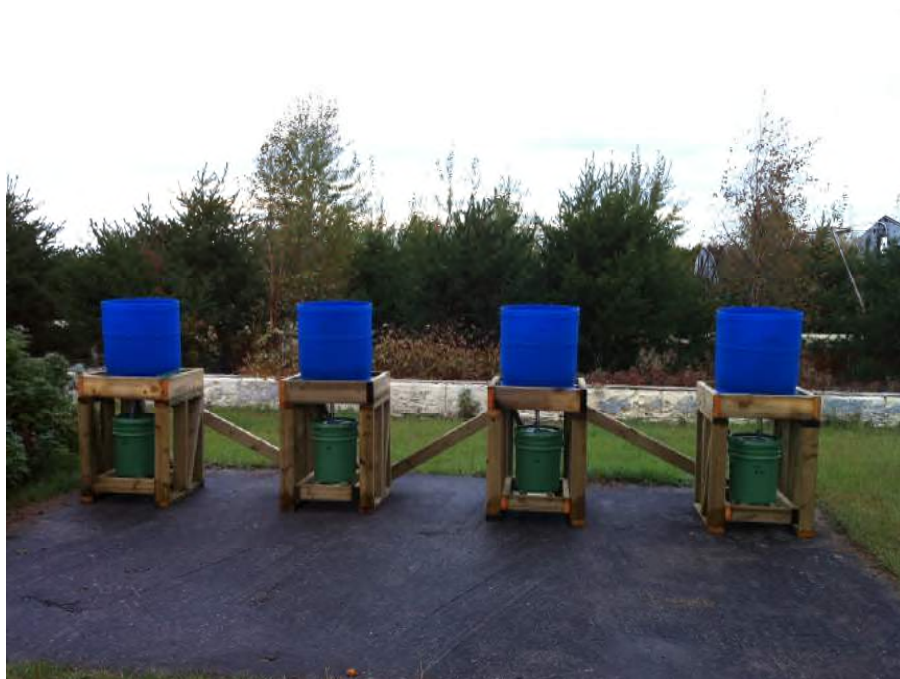
Figure 3.6 Geochemical Field Cells