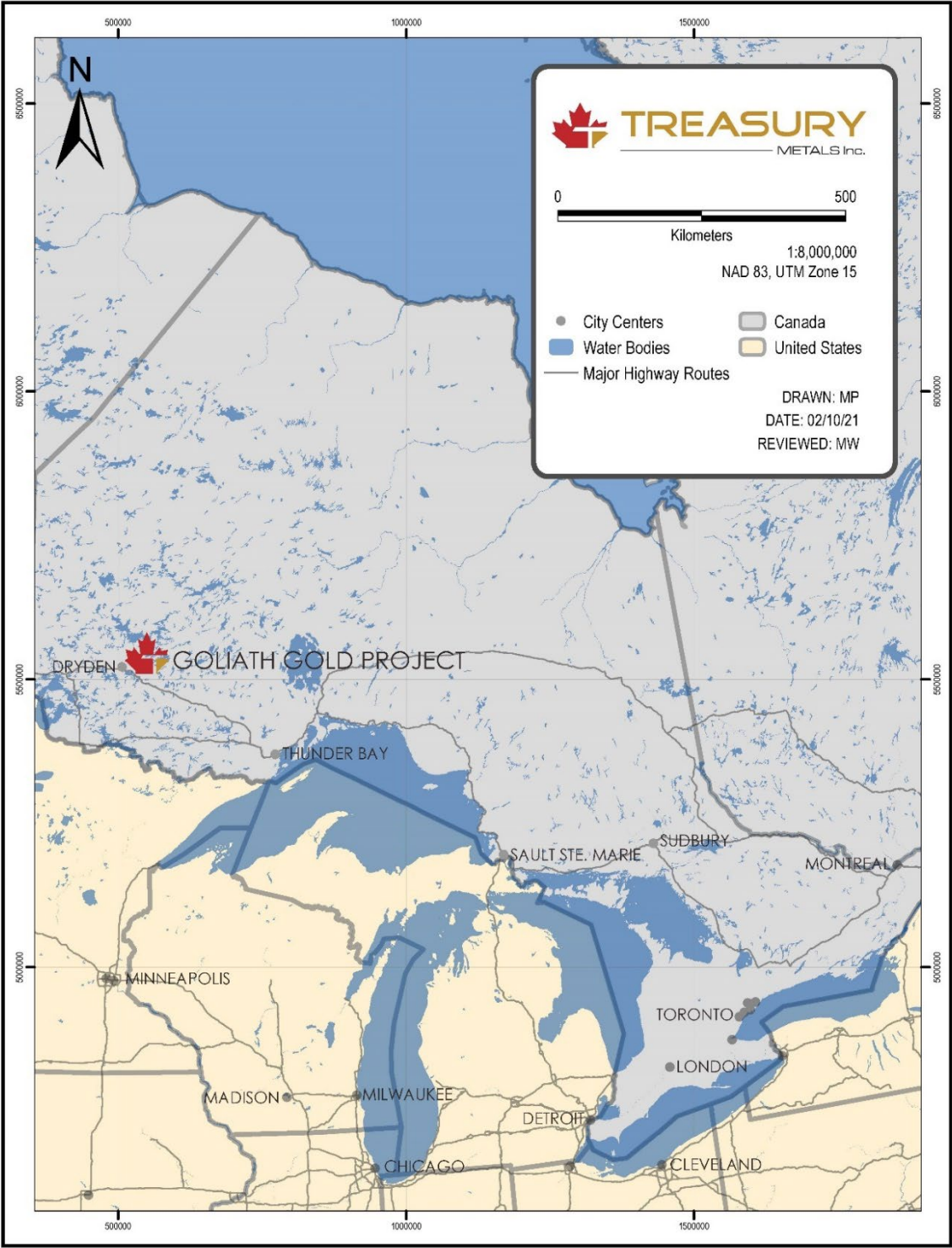
Figure 1: Project Regional Location